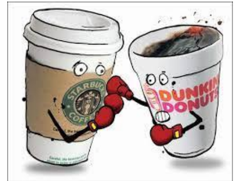
Dunkin' Vs Starbucks, which side are you on?

Can you decide which one you like better?